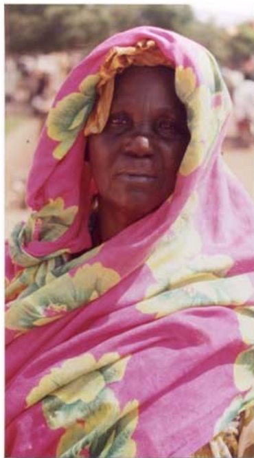
Image of Bambara widow photographed at the Widow's and Children's Cooperative in Bamako where bologan cloth was made.

http://blogs.worldbank.org/africacan/neglected-and-poor-widows-in-mali